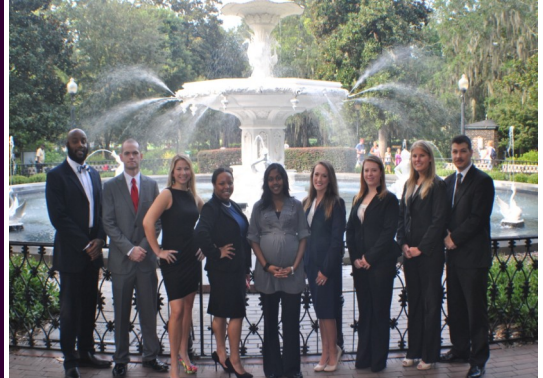
Savannah Law School Evening Students

Students joining the Savannah Law School community exemplify a variety of different back-